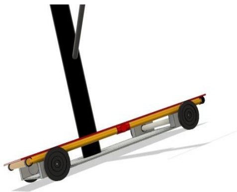
Fig. 1: Base

The base of Robotic Arm measures 60× 42cm horizontally as shown in fig. 1. These base houses, the basic circuit for arm operation and is provided with ultrasonic sensor and the water storage required for cleaning. The height of bot is 1.25 m thus providing a sufficient accessibility during cleaning operation.