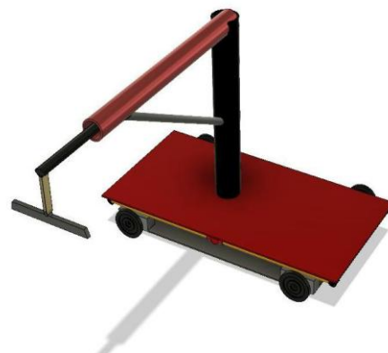
Fig. 2: Robotic Arm with wiper

The arm section of the design comprises of a linear actuator which is enveloped in a pipe, which provides a suitable path for its movement and is itself 1 m in length as shown in fig. 2. The Linear Actuator in this pipe can be extended to further 1 m, thus satisfying any length requirements in present condition as well as in future. The head which is at the tail-end of linear actuator consist of cleaner, and is associated with a DC water pump for cleaning of panel. The head is mounted with ultrasonic sensor for accurate positioning of panel cleaner. The Ultrasonic sensor on the panel is programmed to work at 5 cm whereas the ultrasonic sensor at base is set to 20 cm to avoid any obstacles for proper orientation of bot.